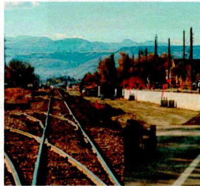
Gold Line Light Rail

Finally, the increased sales and use tax provides funding for the new Ward Road commuter rail station at 53 rd and Ward Road. This location needs new and updated roads, sidewalks, a pedestrian/bike bridge, and a traffic light— completing access and taking full advantage of both the rail line as an economic driver in the northwest corner of the city as well as offering unique access to Denver and Denver International Airport.