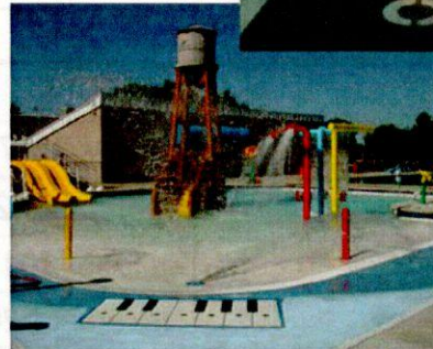
Anderson Park Building and Pool